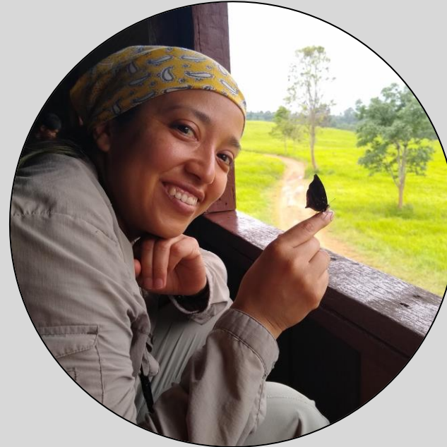
Assistant Professor Swarthmore College