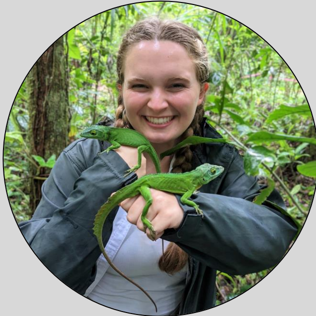
Postdoctoral Researcher New York University