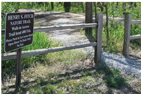
Kansas Biological Survey

Meetings and tours for the International Society for the History and Bibliography of Herpetology, plus day trips and tours